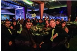
Current Kenton parents having a great time.