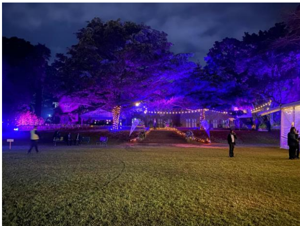
Our School dressed spectacularly for the event.